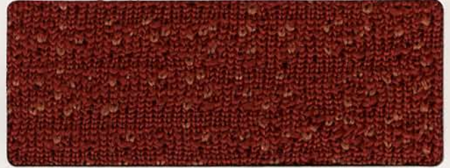
119 DARK CRIMSON